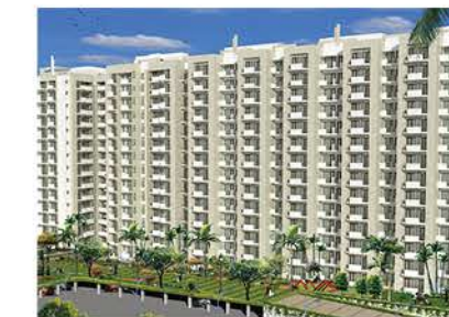
Terra Castle (Possession Soon)