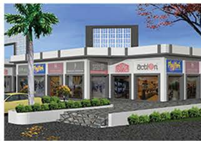
Terra City Bazar