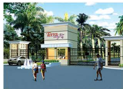
Terra City - II