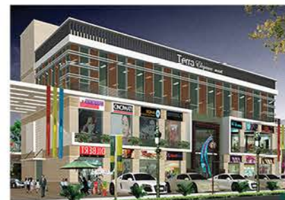
Terra Elegance Mart