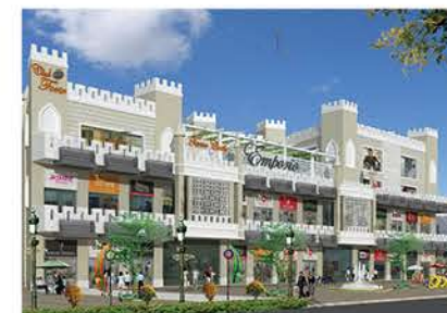
Terra Castle Plaza (Possession Soon)