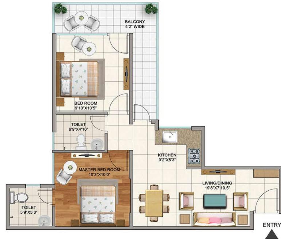
2 BHK Unit Plan Carpet Area = 498.427 Sq. Ft. Balcony Area = 100 Sq. Ft.